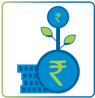
Return of Charges